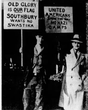
CONNECTICUT TOWNSMEN WHO DON'T WANT NAZIS FOR NEIGHBORS: Two citizens of Southbury parading on one of the town's roads against the proposed establishment of a German-American Band camp within the limits of their community. Voters at a recent town meeting balloted 122 to 41 to create a zoning commission which framed a measure to block setting up the camp.