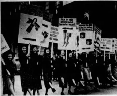
PUTTING THEIR BEST FOOT FORWARD FOR CHINA: In an effort to induce other New York women not to wear stockings made from Japanese silk, a group of sympathizers with the Chinese in the present Far East conflict, parade through a downtown street wearing non-silk hose and carrying "best-of" placards.