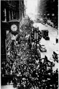
THE CHRISTMAS SHOPPING SEASON IN FULL SWING: Scene at the corner of State and Madison Streets, Chicago, showing the sidewalks jammed with shoppers despite the near-zero weather, as the rush to buy gifts taxed the staffs of department stores and specialty shops.