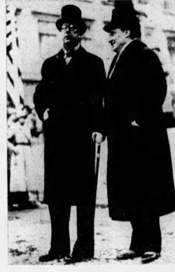
GOVERNOR GABLE VISITS SWEDEN TO DEDICATE GIFT: The Pennsylvania Executive (right), whose ancestors were among his state's first Swedish settlers, with Crown Prince Gustav Adolf at the unveiling of a plaque presented to Gettysburg University by the University of Pennsylvania.