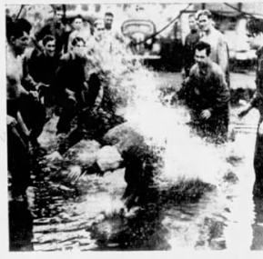
CALIFORNIA STUDENTS CELEBRATE SEASON'S FIRST HEAVY RAINFALL WITH A MED BRAWL: members of the Los Angeles Diesel Engineering School, making the most of a recent rainfall, push lockers (redskins) into a mud pond formed by water on the campus and give them a dunking as part of their initiation.